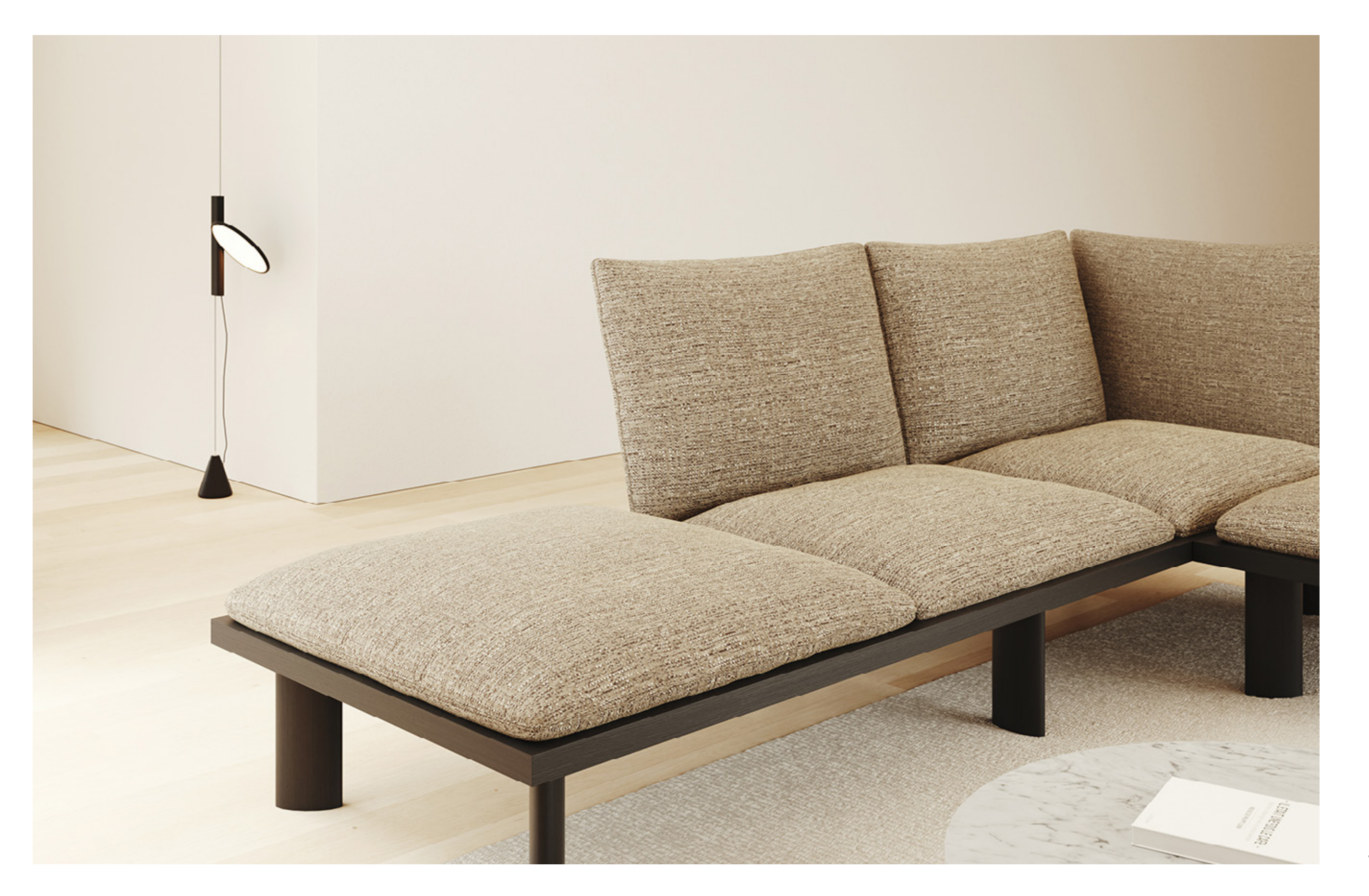
Plush Grid 3020-101 West Elm Work Boardwalk Lounge Seating