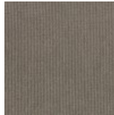
Old Brass 8098-103