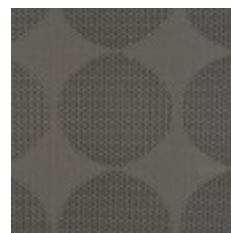
Mussel Shell 8044-803