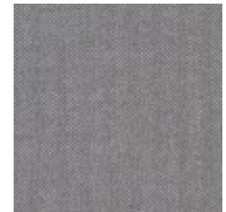
Medium Grey 3741-801