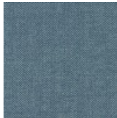
Blue Green 3741-401