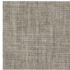
Dark Taupe 3722-103