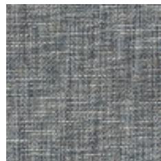
Dark Blue 3722-403