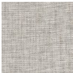
Light Grey 3722-801