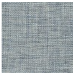
Medium Blue 3722-401