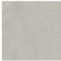
Dapple Grey 4108-802