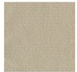
Malted Milk 4108-105