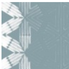
Robin Egg 6642-401